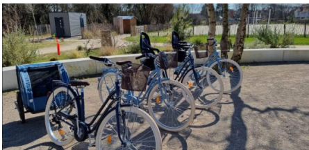
Bikes for rent- Parc de la chaumière +33 (0)7 81 98 46 33