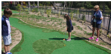
Mini-Golf - Parc de la Chaumière +33 (0)7 81 98 46 33