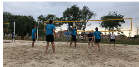
Beach Volley Courts- Parc de la Chaumière - Gratuit