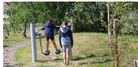
Fitness equipment- Parc de la chaumière