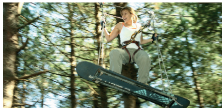
Opalaventure - Open 7j/7 +33 (0)6 81 64 23 42