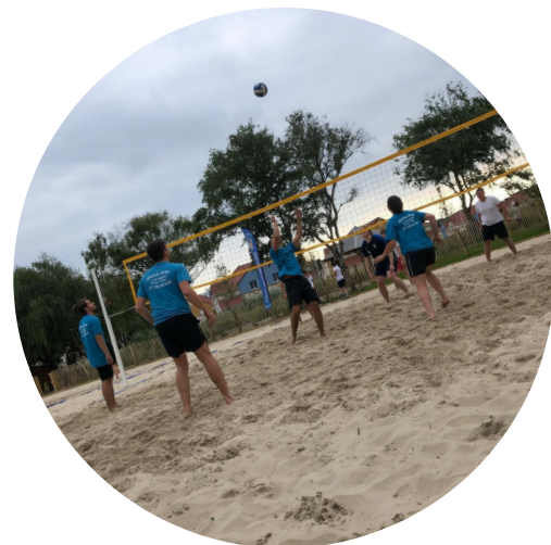
Beach Volley Courts - Parc de la Chaumière - Free

officedetourisme@camiers.fr - +33 (0)3 21 84 72 18