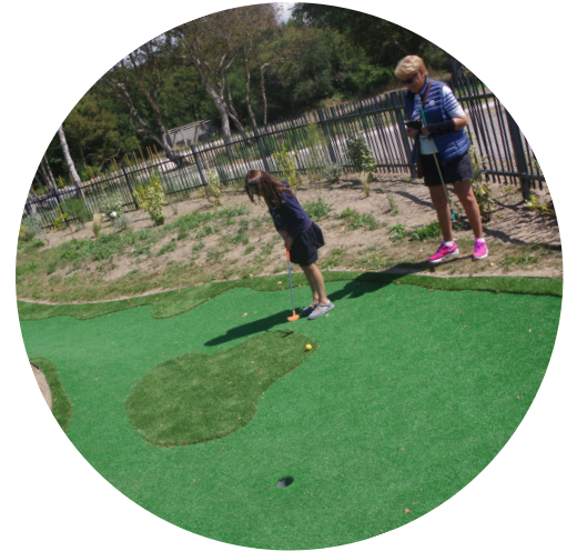
Mini-Golf - Parc de la Chaumière +33 (0)7 81 98 46 33