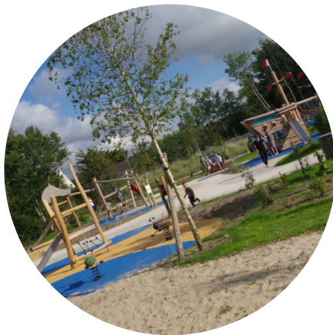
Childrens Games - Parc de la Chaumière - Free