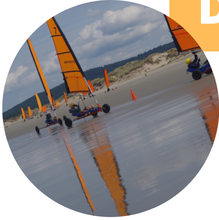
The Sand Yatch - Réservations au +33 (0)3 21 89 60 81