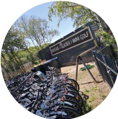
Bikes for rent - Parc de la chaumière +33 (0)7 81 98 46 33